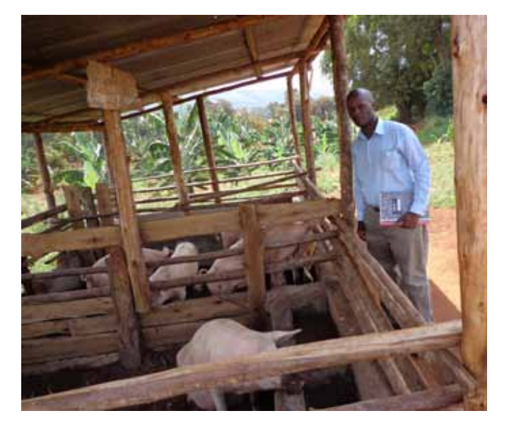
INDEGENIOUS MICRO ORGANS structure at Mwiri P/S it's a new technology for good management of piggery enterprise