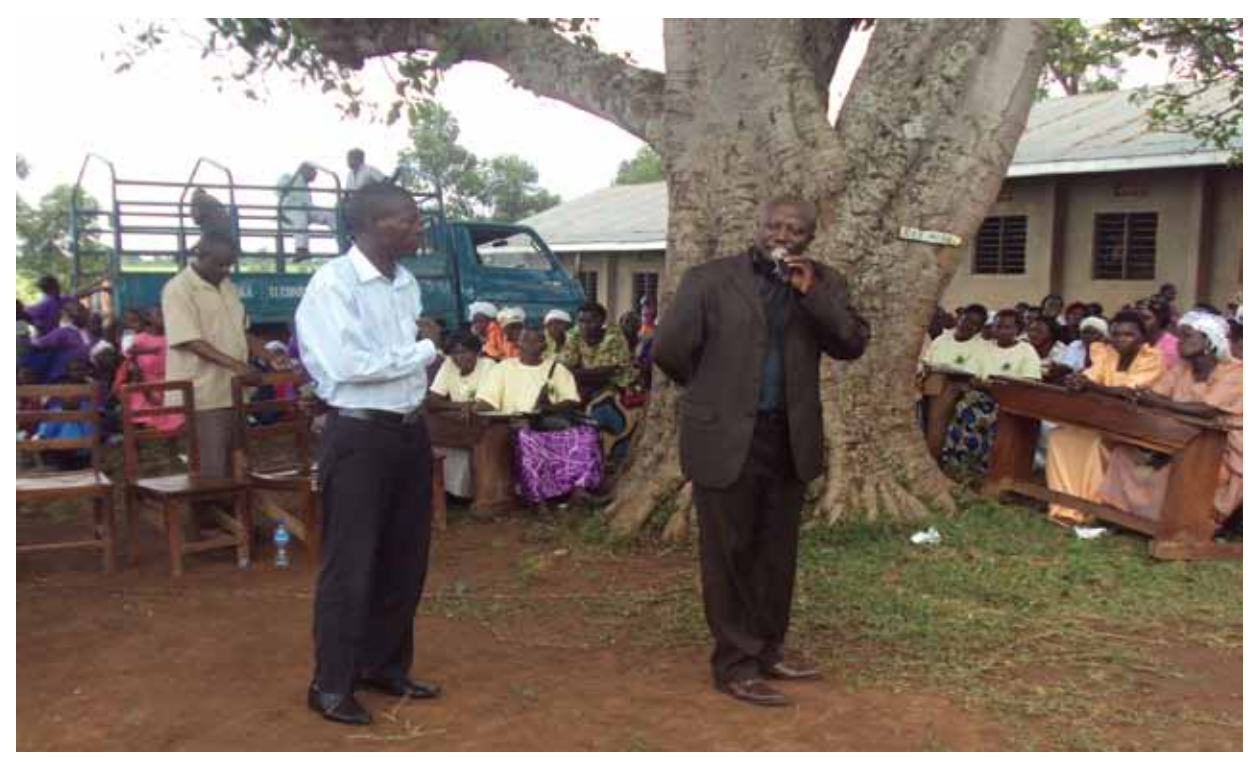
District Chairperson during the launching of HESAN campaign