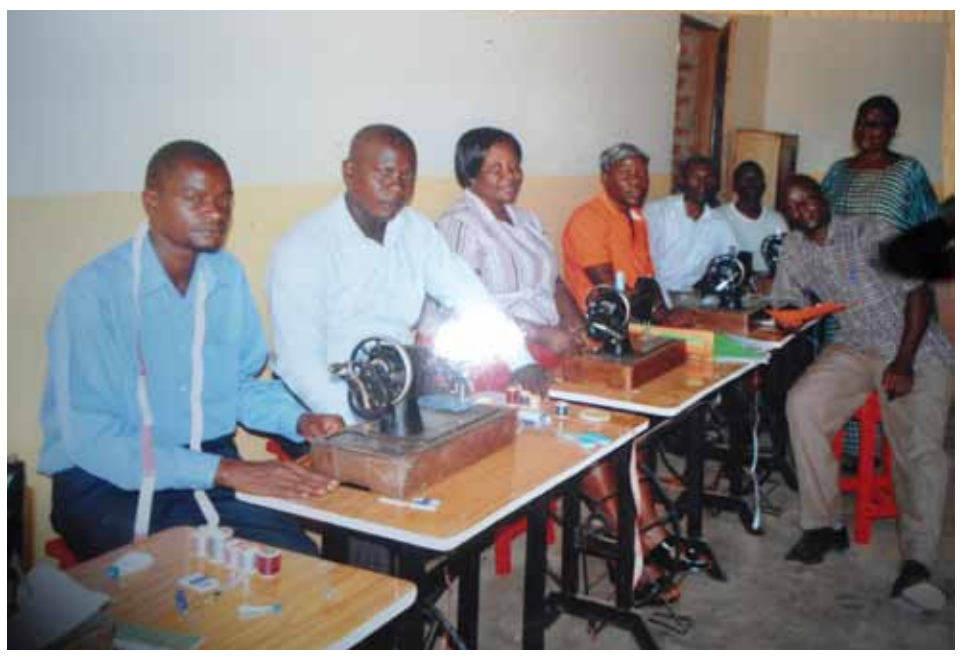
JOPA carpentry workshop and technical services received sewing machines under CDD