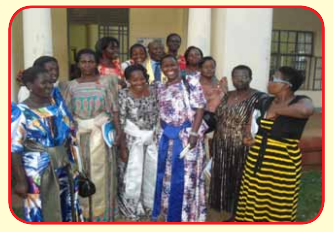
The District female councilors pose with Gume for a group photo after he was named ULGA President