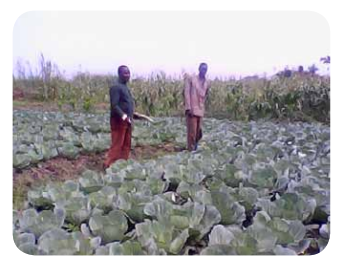
Food security farmer at Kagoma gate