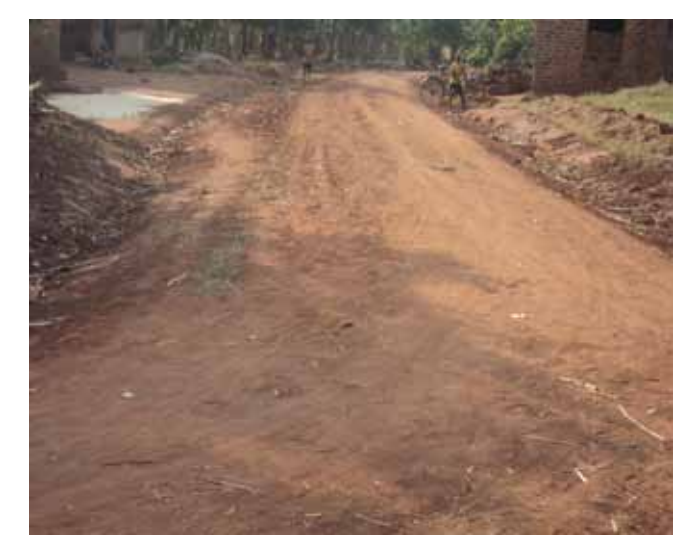
Bukoloboza - Nawamboga road of 2km was opened under Road fund