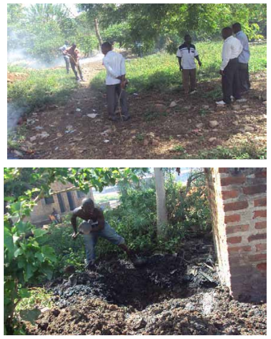
Sanitation week activities which included home visiting for sanitation improvement at Muguluka trading centre, Buwenge sub-county