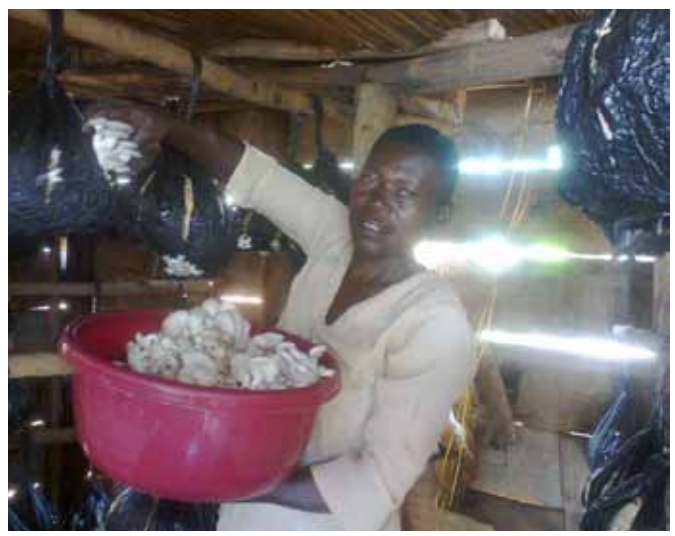
Tamuzadde harvesting her mushrooms for sell (market oriented farmer)