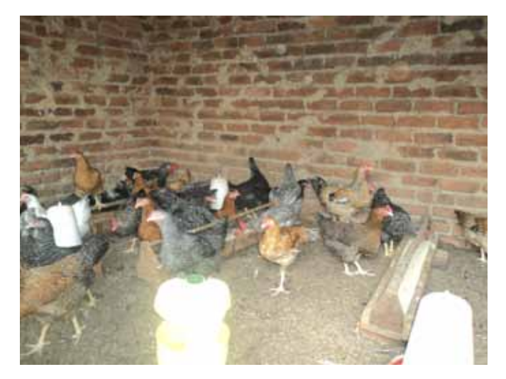
Zerida Ikaali in Kamira village, Butagaya s/c received kuroiler birds