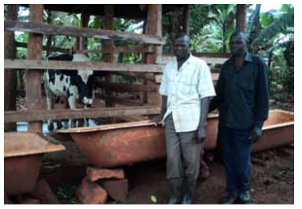
A NAADS farmer in Buwagi parish received a heifer