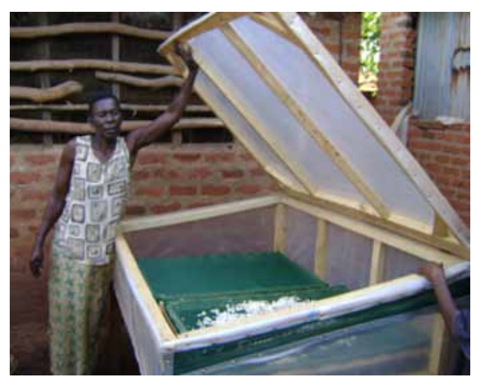
Tamuzadde in Wairaka receives a Solar drier for mushrooms