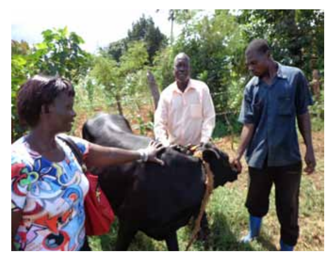
One of the beneficiaries in Mwiri College, Mwiri parish receives a heifer