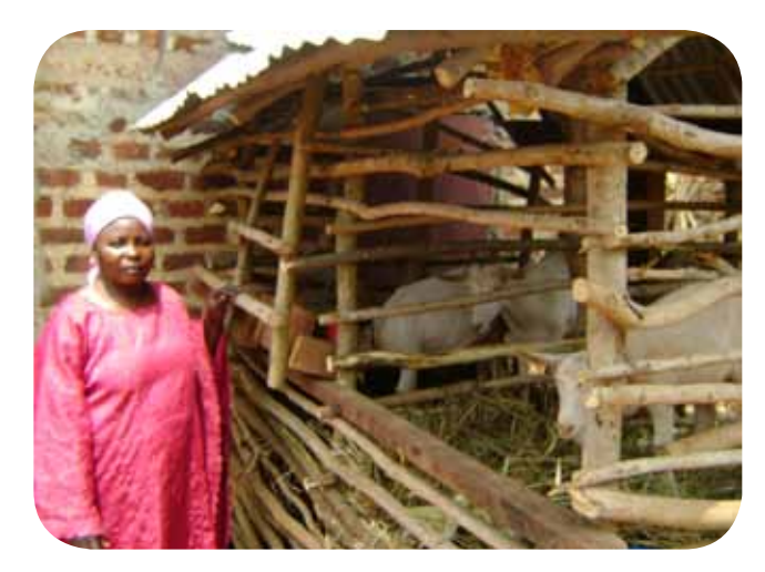
One of the beneficiaries of scanen dairy goats in Polota