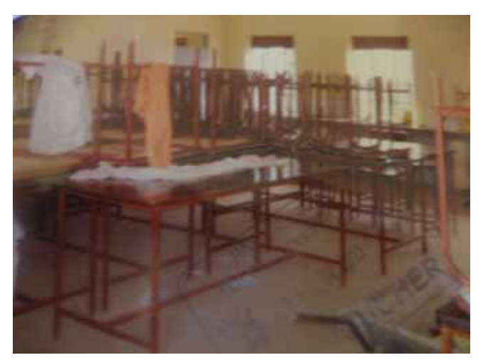
Furniture at Busede Seed Secondary School