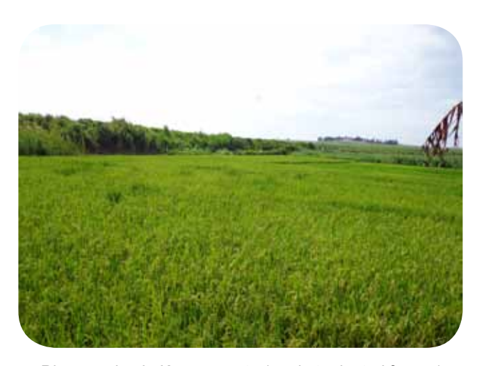
Rice growing in Kagoma gate (market oriented farmer)