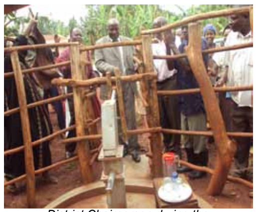
District Chairperson during the commissioning of bore holes

8 springs were re-protected in the villages of Ibungu west in Budondo Sub County, Kanyale and Butangala C in Buwenge Sub County, Kiwumo and Bituli in Butagaya Sub County, Namisota A and Nabitosi in Buyengo Sub County and Kasozi in Busede Sub County. 20 boreholes have been rehabilitated in various locations in the district, 1 Ecosan toilet is being constructed at Muguluka trading centre. 60 old water sources were tested for water quality.