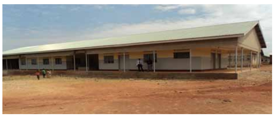
Buwenge General Hospital (Kagoma) under construction