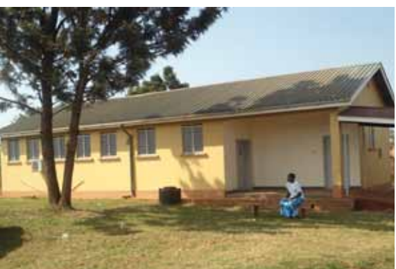
Bugembe HC/IV Theatre was completed