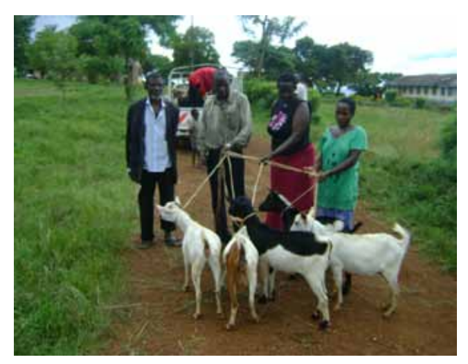
Beneficiaries of Mwiri College receive cross breed goats