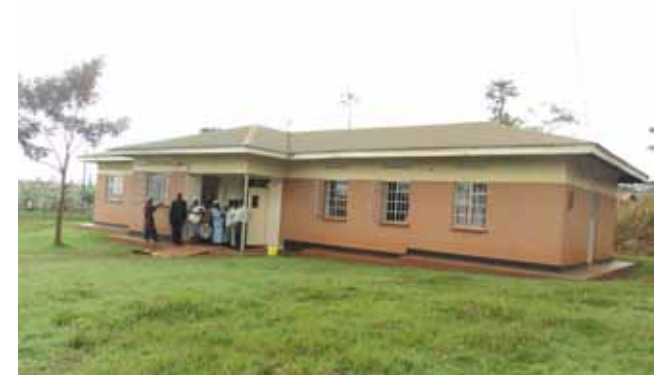
Budondo H/C IV Maternity ward funded by BEL

Bulase (kafenensi)- Bukose via Bwase church 3.8km, Bukose – Naluwere 2.7km, Kyomya central – Kyomya East 4.6km