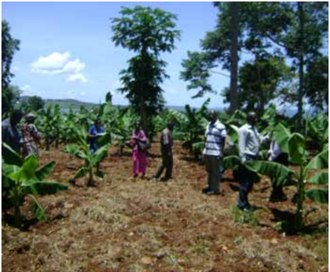
Banana demonstration at Kakira T/C Head quarters