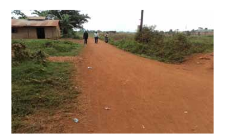
Namizi Central - Kazinga RD under CAIIP