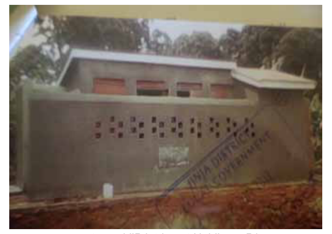
5 stance VIP latrine at Nabilama P/s

over to the sector although electricity wiring and OPD works are now complete.