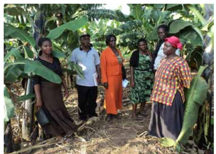
One of the beneficiaries in Kirinya village who was given suckers pose with the councilors and technical staff in her banana garden during monitoring of NAADS projects in Jinja Central