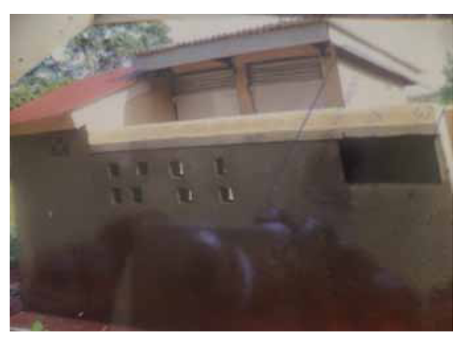
3 stance VIP latrine at Namalere P/s