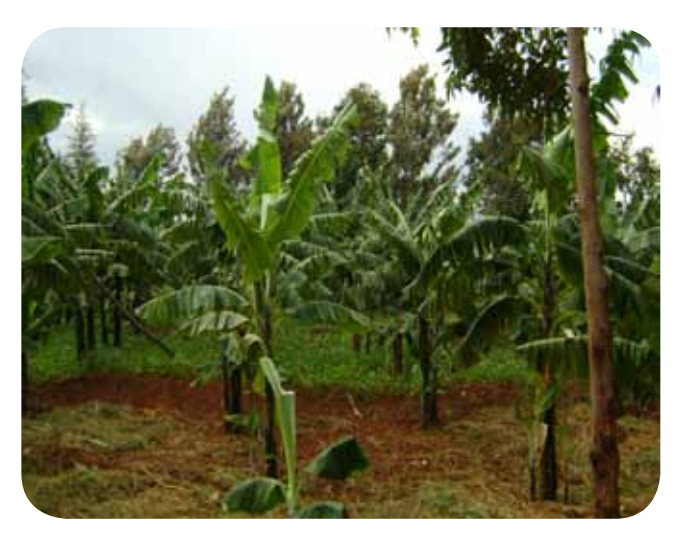
Banana demonstration at MM College kakira