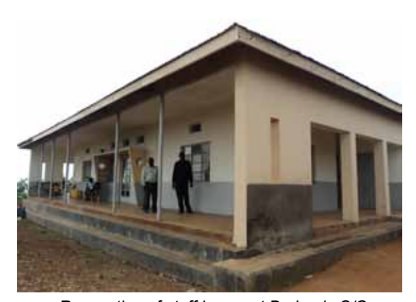
Renovation of staff house at Budondo S/C headquarters under LGMSD