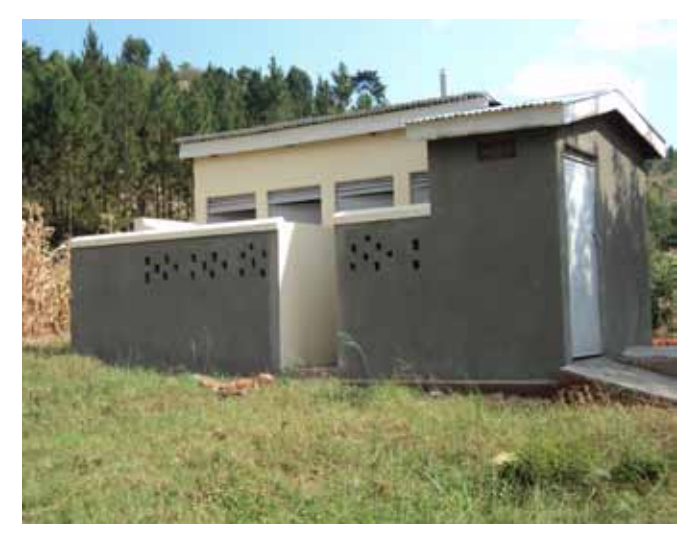
Construction of a 5 stance pit latrine under LGMSD

Despite the above achievements, there were challenges of budget under cuts in all the programs in addition to the community group dynamics and uncertainties.