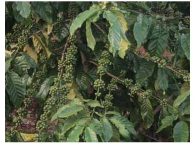
Coffee Plantation at Nakabango