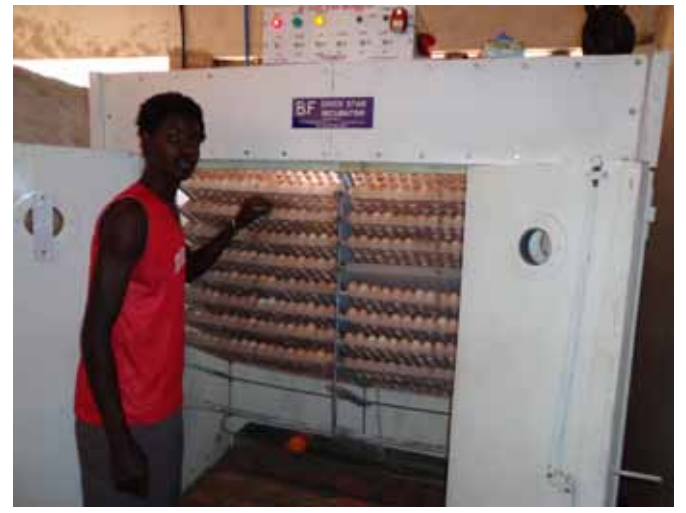
A beneficiary receives a Hutchery in Namaziba, Mwiri Parish (commercial farmer)