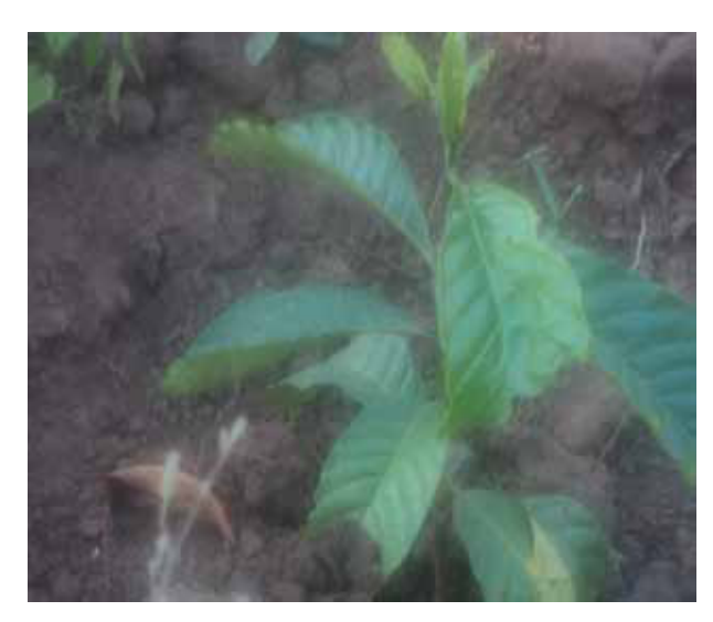
Some of the 540 coffee seedlings that were donated at Kakuba Village, Kisaasi Parish