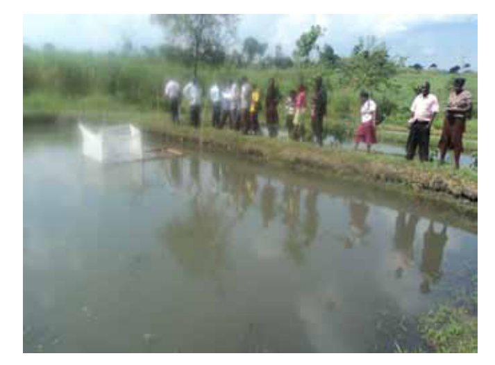
Production committee councilors and staff during the monitoring of a fish farmer in Itengeza Village, Nabitambala Parish