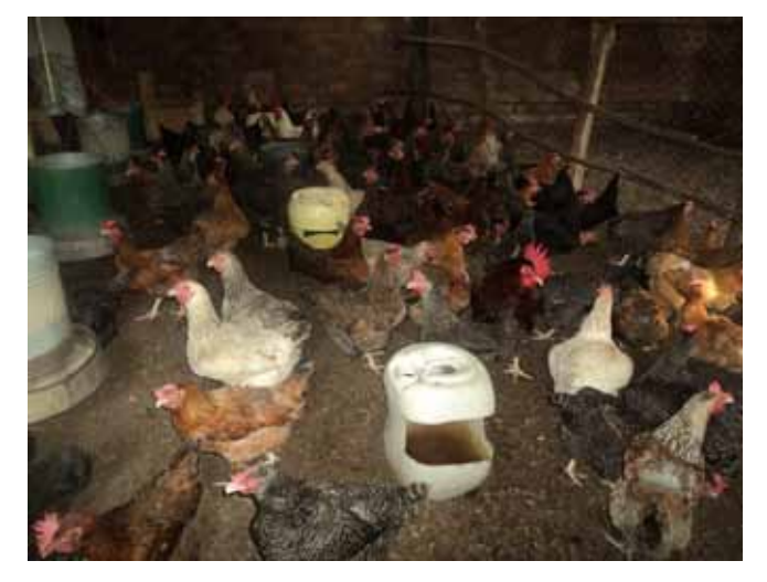
Eva Kwesigwa a farmer in Jinja central division Promoting kuroiler rearing in Jinja district