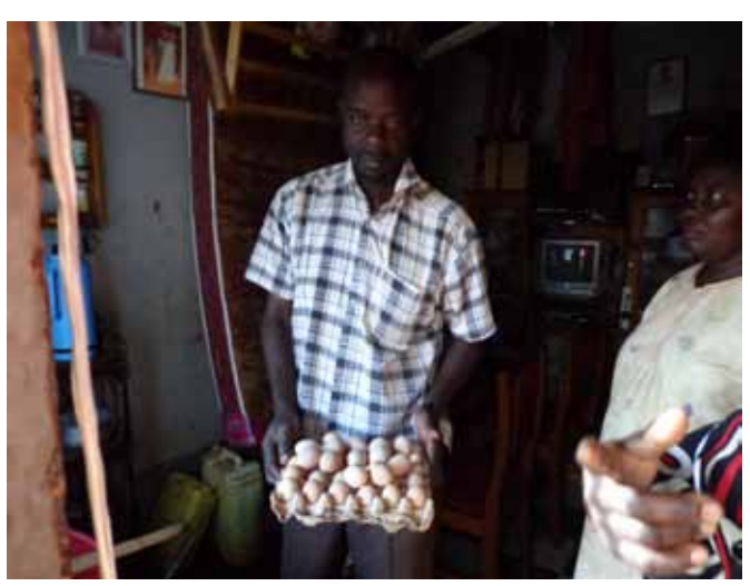
A food security farmer in Polota Parish Kakira T/C