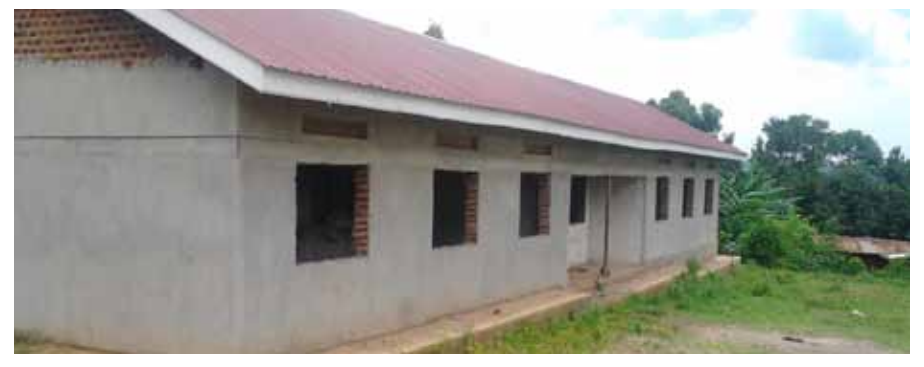
Lukolo H/CIII Maternity ward under construction