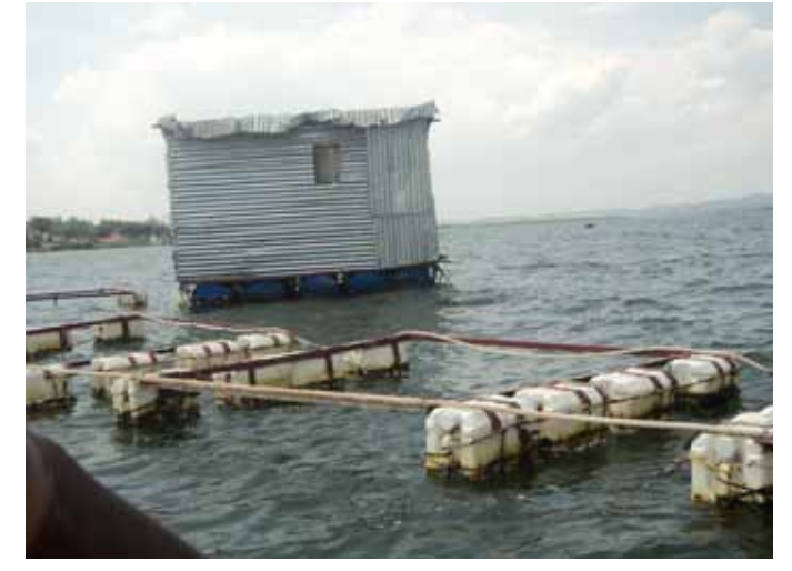
Fish cages on Lake Victoria in Masese division