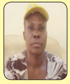
HON. MUKAMA ROSE