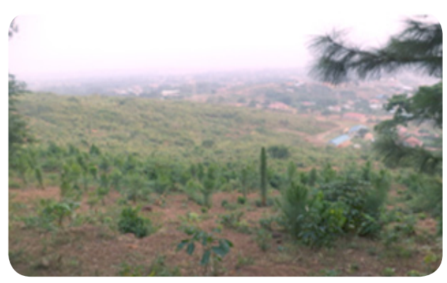
Tree planting at Wanyange Hill