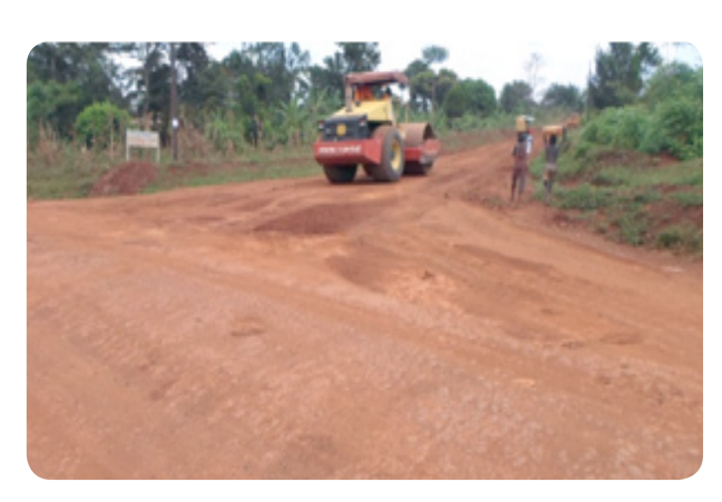
Compaction along Buwekula-Wanyange Road