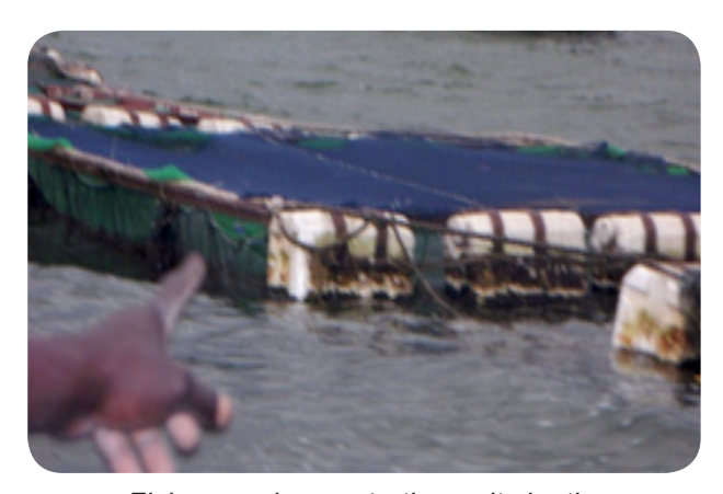
Fish cage demonstration units by the Jinja Fisheries Department at Masese