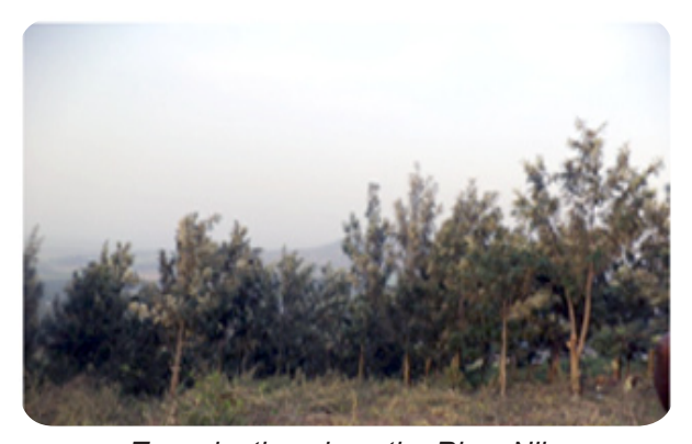
Tree planting along the River Nile