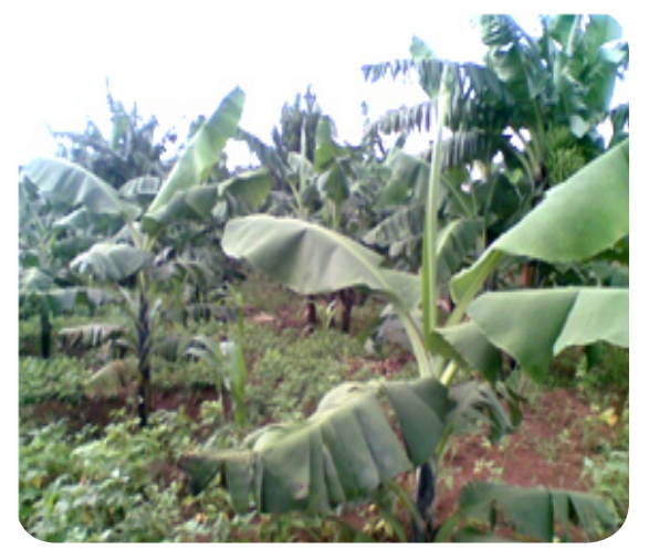
Advisable practice, Ssebagala Asuman, NAADS Beneficiary grows beans in banana garden