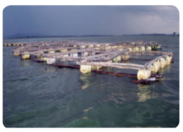
Fish cages made out of locally available materials (Bamboo) at Masese