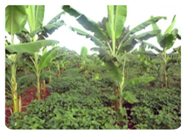
New banana garden for multiplication at Nakabango District Farm