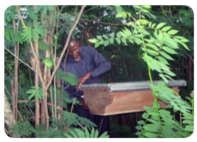
The Senior Entomologist during the inspection of the Bee hive at Nakabango District farm