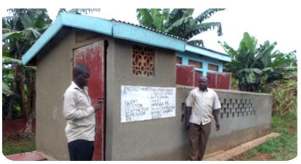
Clerk to council and Eng. Mwoga during the monitoring of a 5- stance brick lined emptable latrine at Nyenga P/S