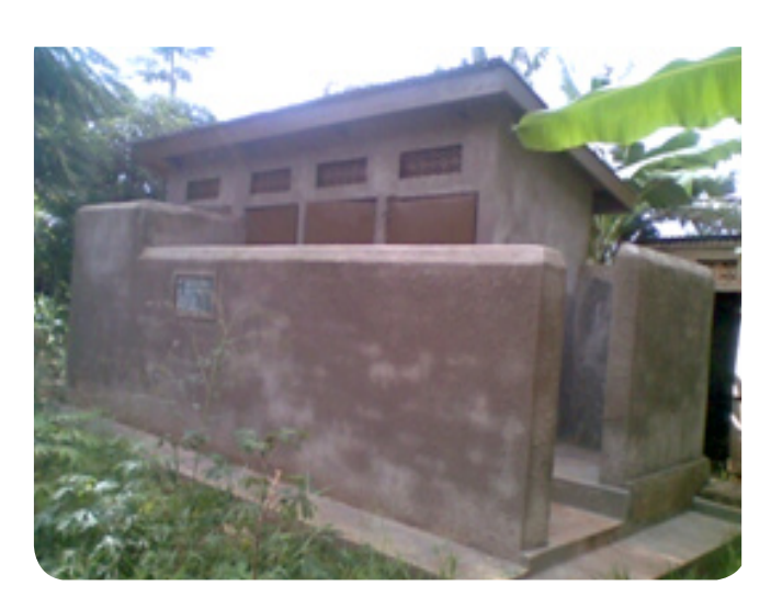
A four Stance Pit Latrine at Kamigo HC II