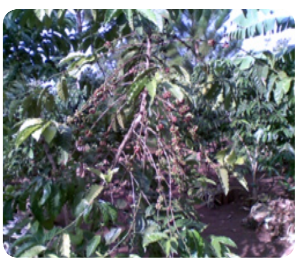
Ndegwe's coffee garden in Namata village Butamira Parish (NAADS)