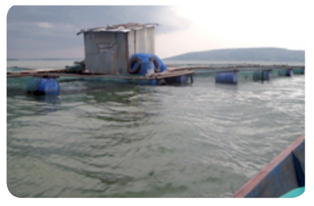
Commercial cage fish farming feed storage structure at Masese