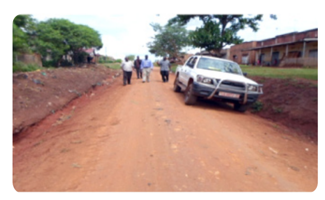
Lubanyi- Buwenge road implemented under force of account system