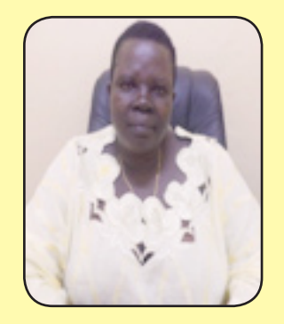
HON. AUMA PAJOBO