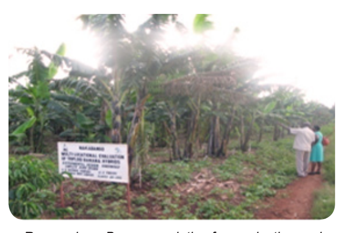
Research on Banana varieties for production and palatability at Nakabango.