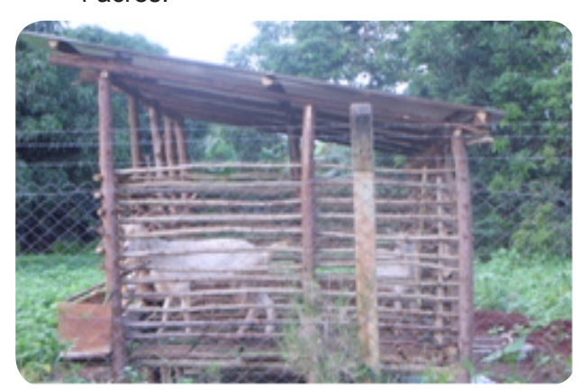
A dairy goat demonstration unit using locally available materials at Nakabango District Farm