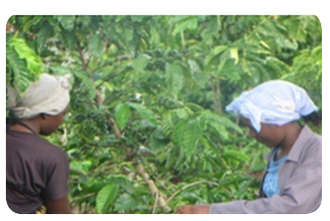
High yielding coffee at Nakabango District farm