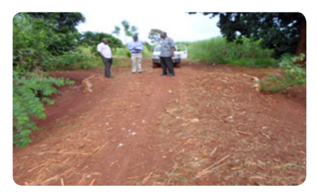
Tezita road-Hajat Musolo-Kainogoga road under CAIIPII