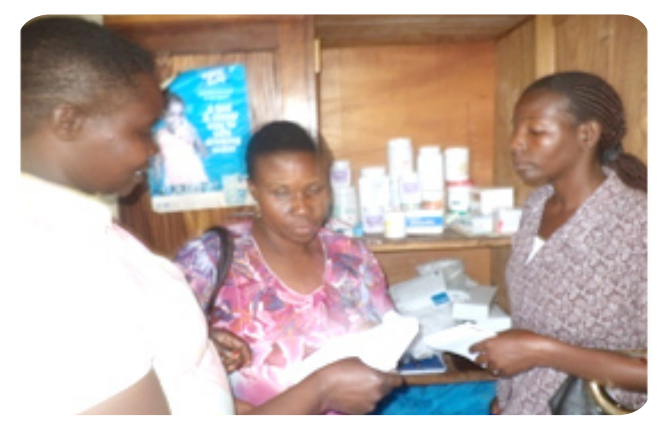
Some councilors from Education & Health committee during drug inspection in the Health Centres of Mafubira, Wakitaka and Bugembe.