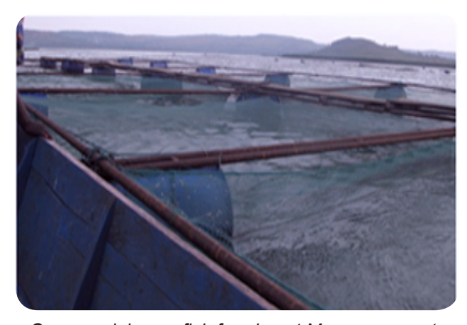
Commercial cage fish farming at Masese promoted by Jinja District fisheries